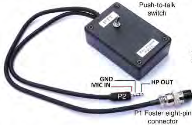
Figure 2 — Cell patch unit.

The schematic for the cell patch is shown in Figure 3, along with the parts lists and vendor information. The design simply connects the cell phone microphone connection to the transceiver's receiver output and the cell phone headphone to the transceiver's microphone connection. However, there are some